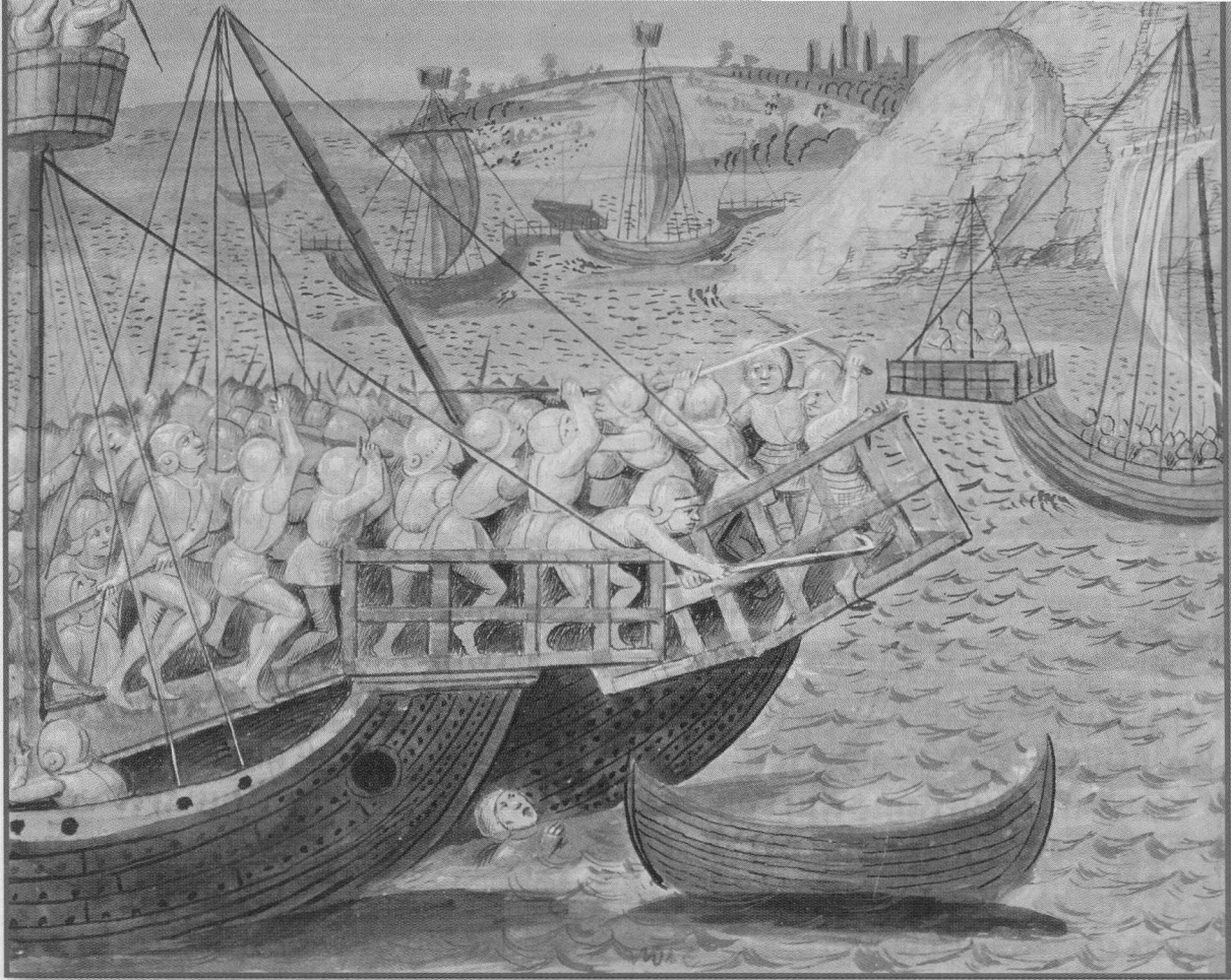
This fifteenth-century illustrated French manuscript depicts Caesar's troops during the Gallic Wars.

could get. Caesar knew that in order to get what he wanted, he would have to be victorious in battle so that his soldiers would be more loyal to him than to Rome. He would also need to have political allies in Rome. If he helped others get some of the power they wanted, then he could use them to get the power that he wanted.