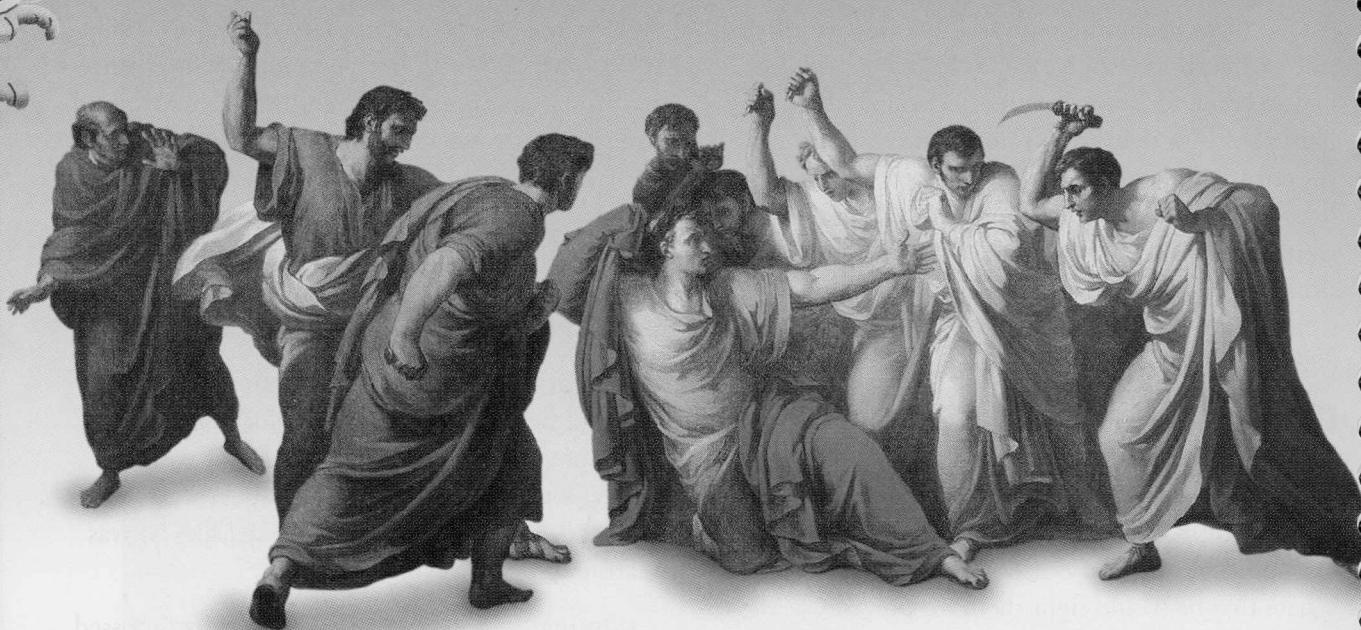
Vincenzo Camuccini, an eighteenth-century Italian artist painted this scene of Julius Caesar's assassination.

Although Caesar had been an excellent general, he was not an especially good dictator. He was arrogant and offended many powerful Romans. He even dismissed his bodyguards, saying that no one could possibly want to murder him since his death would only bring about chaos.